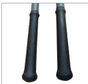
Electrical shocks' rubber protection handle