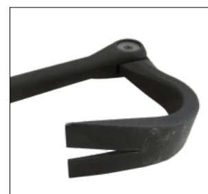
NPB pry bar V-shape head