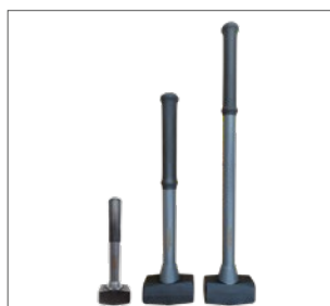
BS5, BS3 & NBS1 sledgehammers

The NBS1 sledgehammer is usually used to quickly gain entry. The grip handle answers the NF EN 60900 norms as it is insulating and can protect from up to 1000V in alternating current and up to 1500V in direct current. The sledgehammers are made of steel. A EBP-N-A tactical bag has been designed to carry on the back a NBS1 small sledgehammer and a NBP small lever.