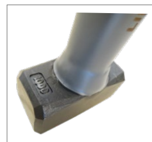
1 kg sledgehammer' s head