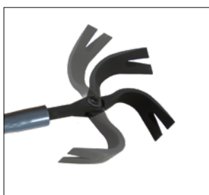
180° indexable head

On option, a transport strap is available (ref. SP/NPB).