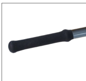
Electrical shocks' rubber protection handle