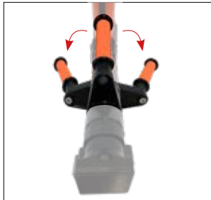
handle on the horizontal jack 90° indexable on 3 positions.