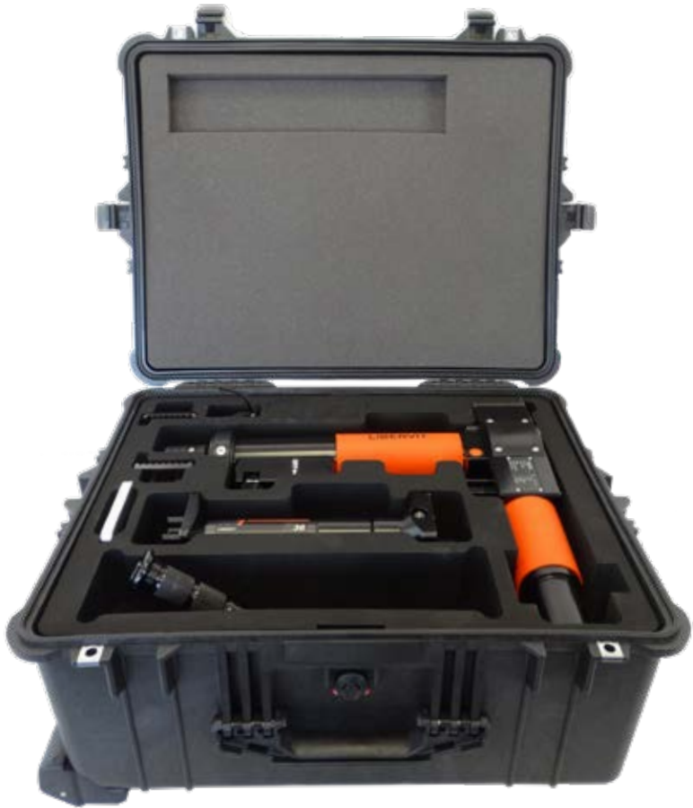
PELICASE® transport case, ref. VDT/HR7